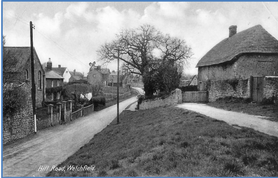
Above. The Methodist Chapel is located on the left in this 1955 photo Below. The gable end of the Chapel just appears on the right, in this 1925 picture, opposite the village water pump.